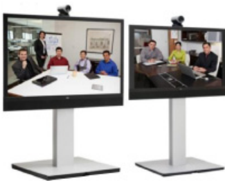
Cisco Telepresence MX Series