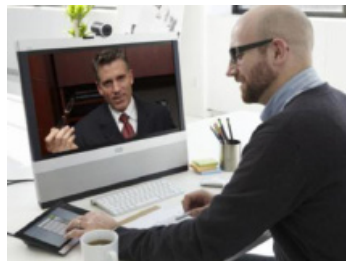
Cisco Telepresence EX Series