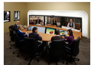
Cisco Telepresence 3000 Series