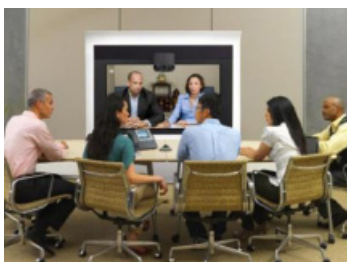
Cisco Telepresence 1300 Series