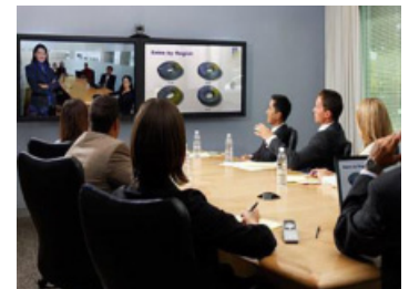
Polycom HDX Series